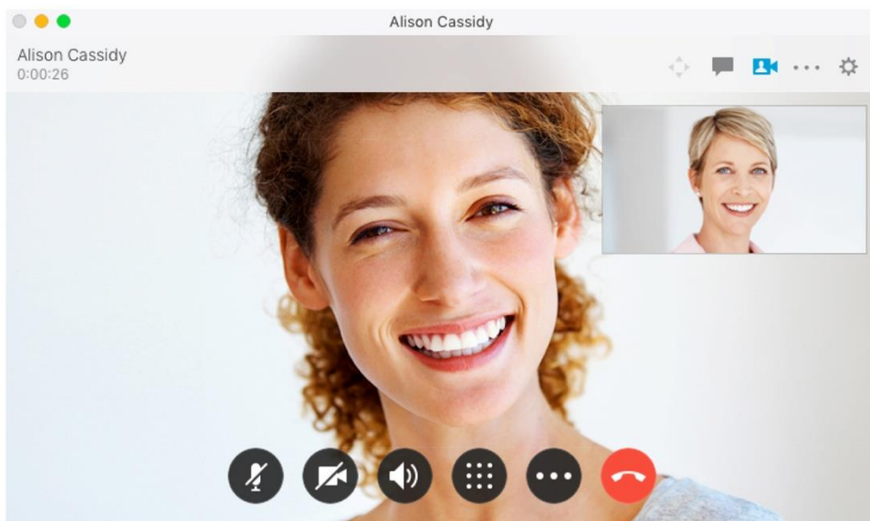
Figure 3. High-definition video with integrated audio controls

The Cisco Jabber client delivers business-quality voice and video to your desktop. Powered by the market-leading Cisco® Unified Communications Manager call-control solution, it is a soft phone with wideband and high-fidelity audio, standards-based high-definition video (720p), desk phone control features and support for up to 8 lines with Multiline. These features mean that high-quality and high-availability voice and video telephony is available at all locations and to users' desk phones, soft clients, and mobile devices. The Cisco Jabber solution makes voice communications simple, clear, and reliable (Figure 3).