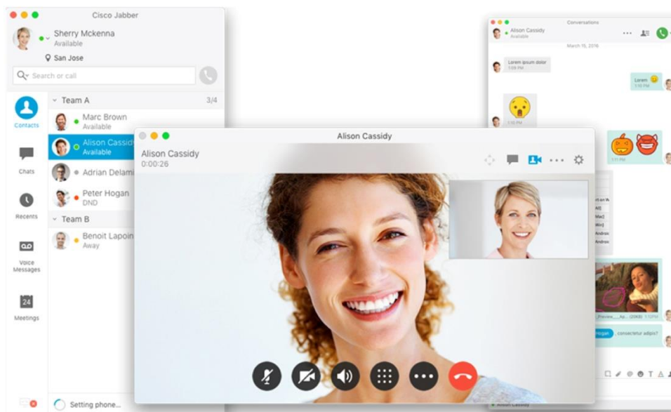
Figure 1. Cisco Jabber for Mac

The Cisco Jabber client streamlines communications and enhances productivity by unifying presence, instant messaging, video, voice, voice messaging, screen sharing, and conferencing capabilities securely into one client on your desktop. Cisco Jabber for Mac and Cisco Jabber for Windows deliver highly secure, clear, and reliable communications. They offer flexible deployment models, are built on open standards, and integrate with commonly used desktop applications. With the Cisco Jabber client, you can communicate and collaborate effectively from anywhere you have an Internet connection (Figures 1 and 2).